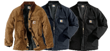
CARHARTT BROWN DARK NAVY BLACK