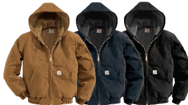
CARHARTT BROWN DARK NAVY BLACK