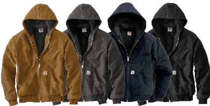
CARHARTT BROWN GRAVEL DARK NAVY BLACK