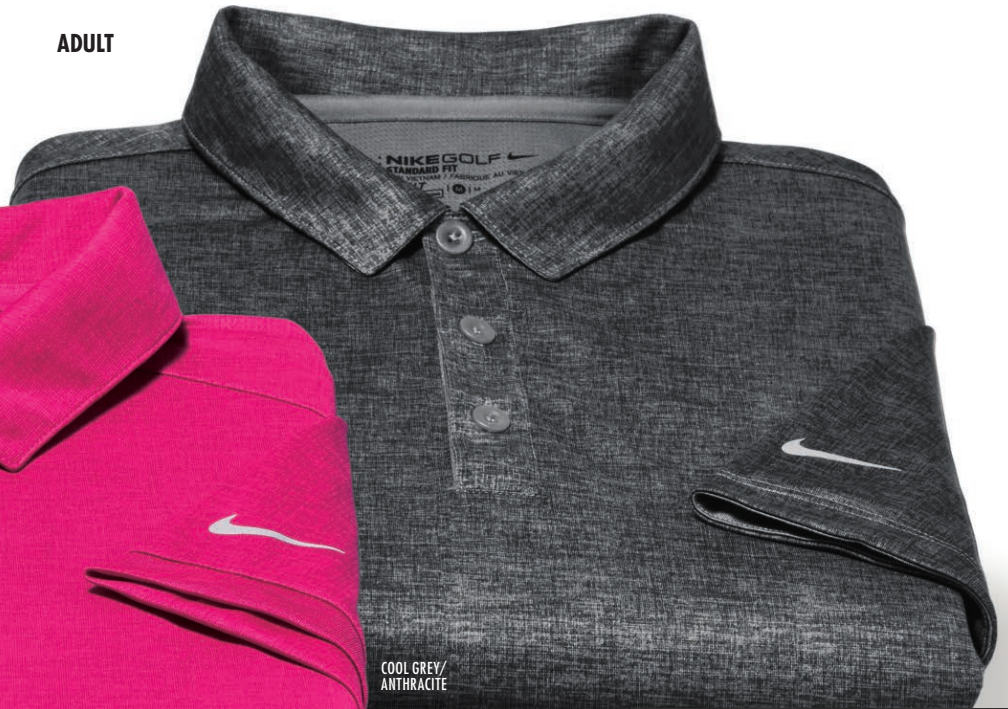
COOL GREY/ ANTHRACITE