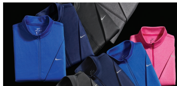
Dark Grey Heather, Gym Red (Adult Only), Game Royal, Midnight Navy, Anthracite, Black